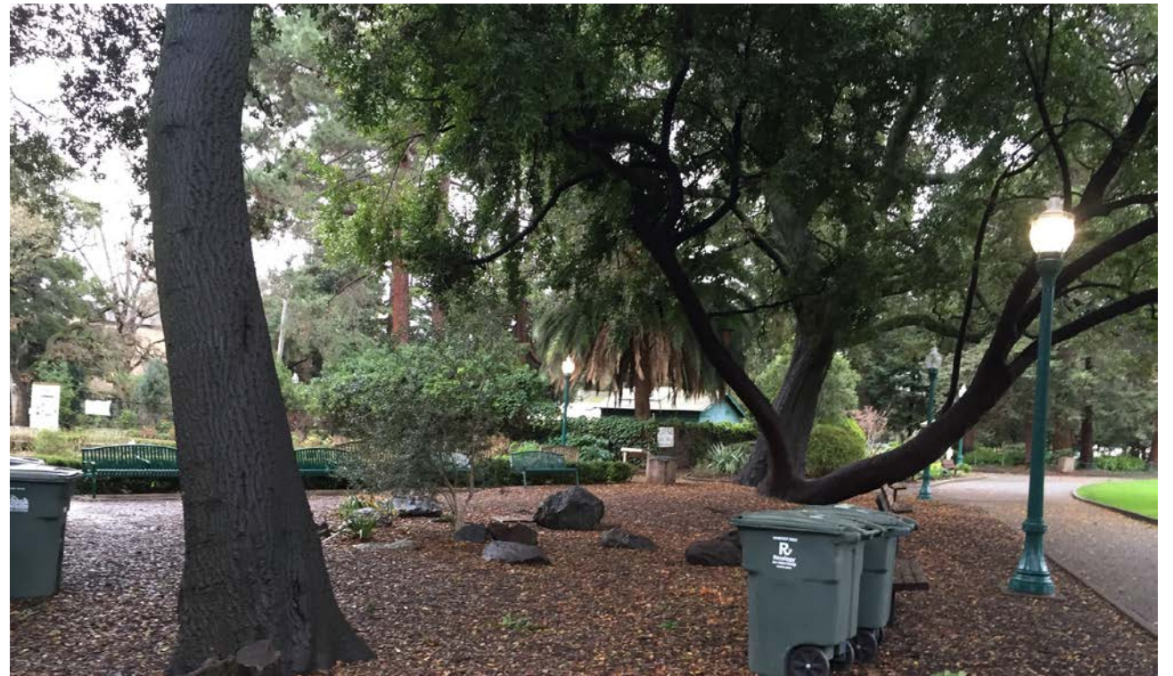
Photos of Existing Site